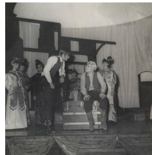
(bottom right) BCC Winter Weekend at Eastover in the Tally Hoe Barn